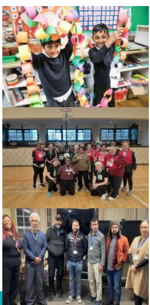
The best of London in one borough